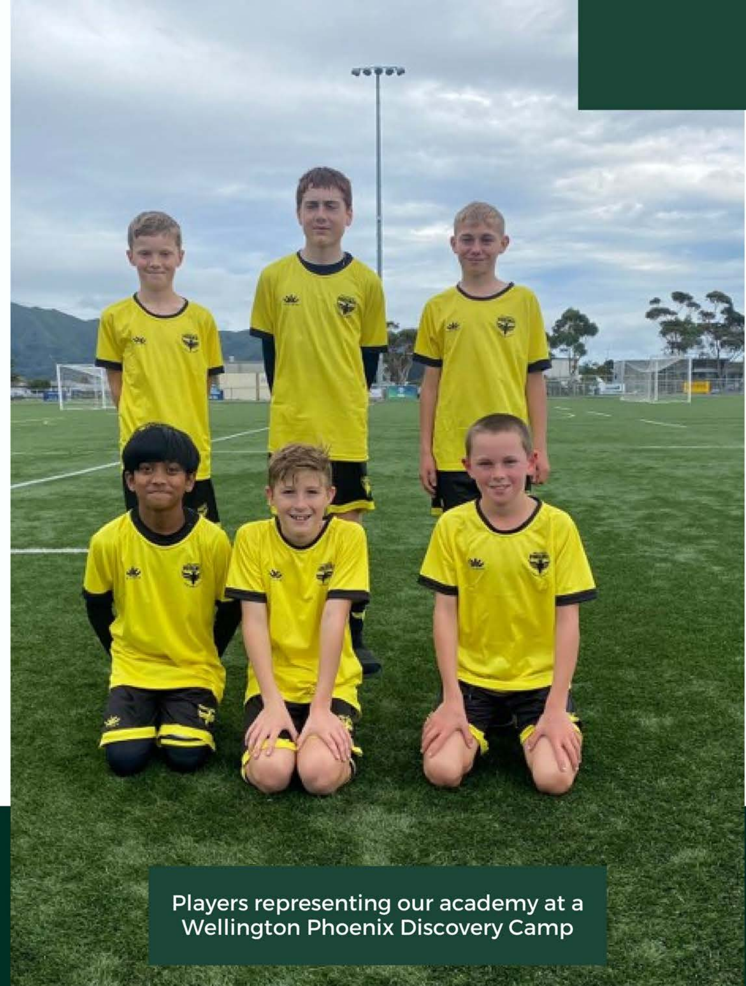
Players representing our academy at a Wellington Phoenix Discovery Camp

We also have exclusive access to Wellington Phoenix experiences and pathways for our players.