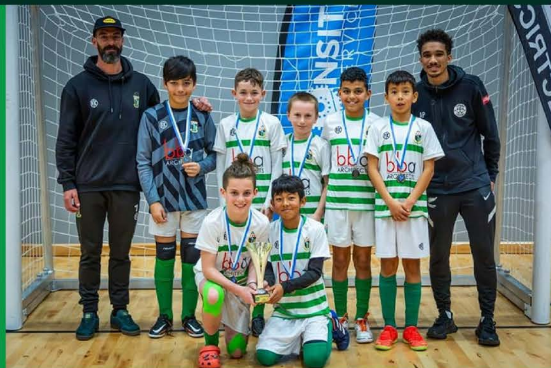
HB Futsal Tournament U11 Champions 2023

We get enormous satisfaction from seeing our players succeed in multiple ways within the academy, including;